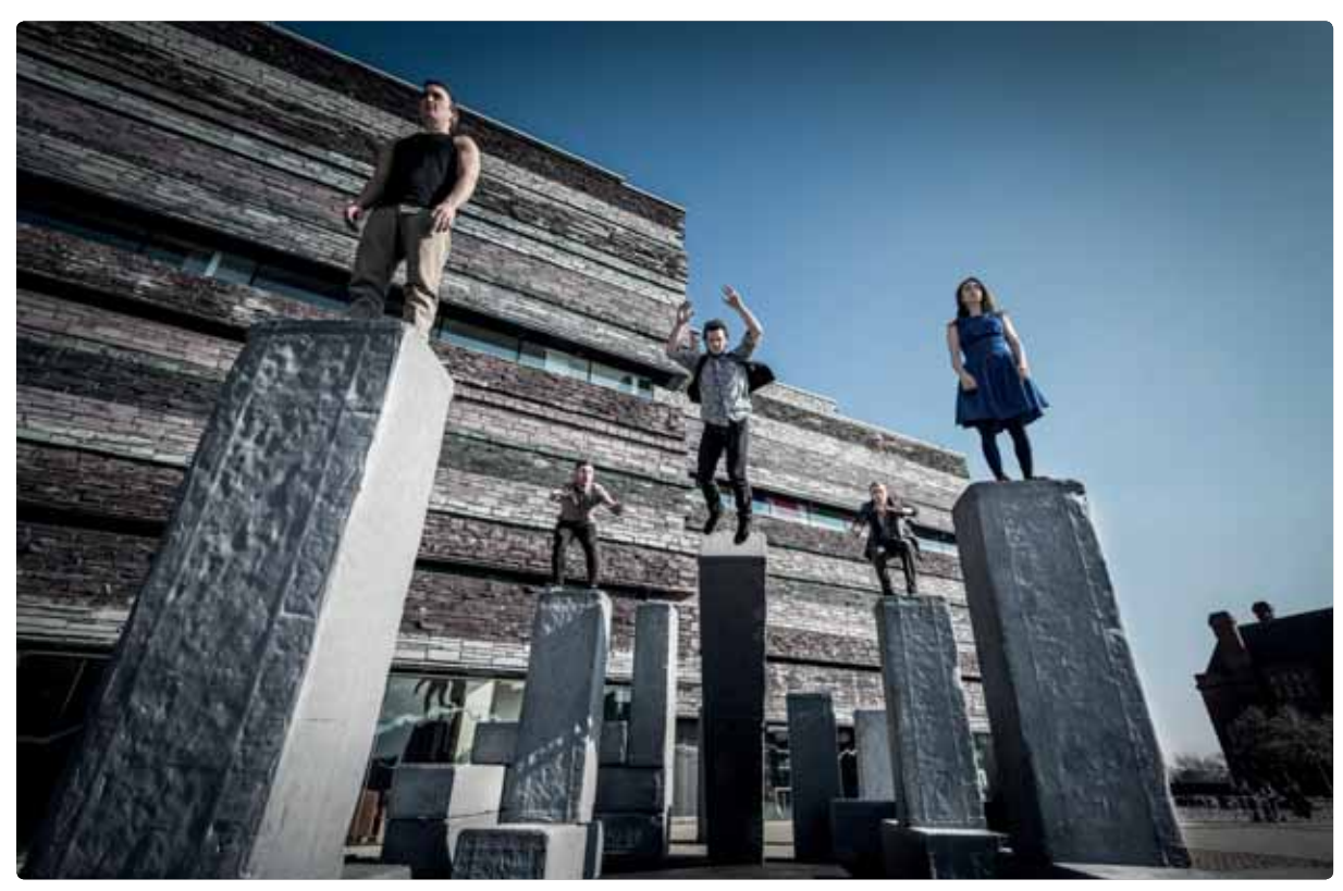
Block, NoFit State