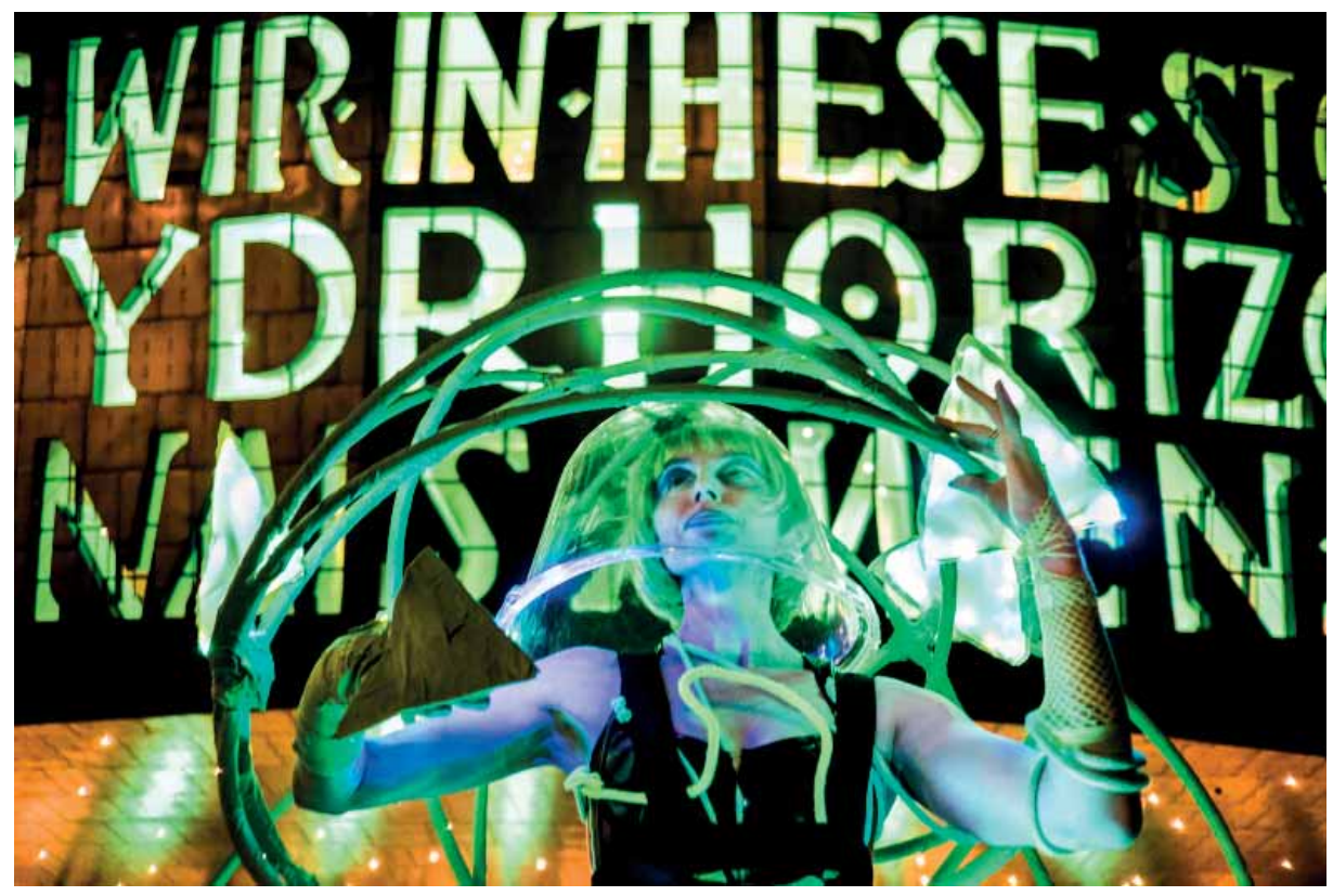
Carnifal y Môr, National Eisteddfod, Cardiff

Wales is changing, and changing fast. A generous, fair-minded and tolerant society values and respects the creativity of all its citizens. It's a society that embraces equality and celebrates difference, wherever it's found in race, gender, sexuality, language, age or disability. These differences are our possibly our strongest assets. They provide an unique cultural narrative for Wales and connectors with others internationally. Our culture is enriched and expanded by learning from the experiences of others from around the world. And as we explore cultures further afield, we learn more about ourselves.